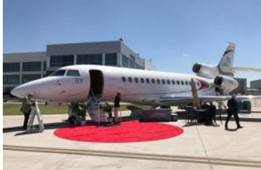
World's first Christian airline to cater to missionaries, charge no luggage fee